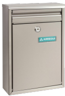
L29406 Satin Stainless Steel