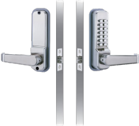
L29153 CL410 SS