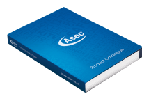
ASEC2018 2018 Catalogue