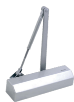
L28421 Size 3