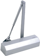
L28421 Size 3