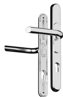
CH30089 59-96mm Centres - Polished Silver