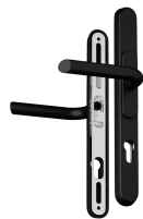
CH30087 59-96mm Centres - Black