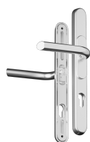
CH30088 59-96mm Centres - Brushed Silver