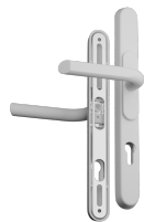
CH30086 59-96mm Centres - White