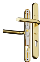
CH30090 59-96mm Centres - Gold