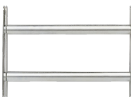
L27301 700mm - 1050mm W x 450 mm H