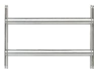
L27298 500mm - 650mm W x 300 mm H