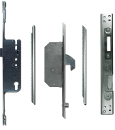
CH10581 45/92 Split Spindle