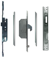
CH10576 25/92 Single Spindle