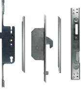
CH10581 45/92 Split Spindle