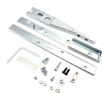
L27110 End load