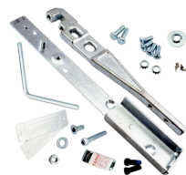
L27109 Side load (anti finger trap)