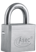
AS11691 Open Shackle