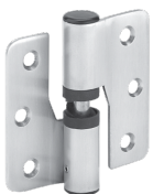
AS10930 80mm - LH Pair