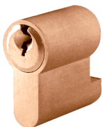
AS10862 PB KD