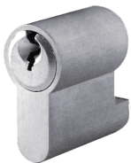
AS10861 NP KD