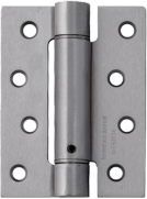
AS10852 Chrome Polished (1.5 Pair)