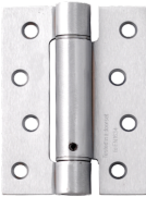
AS10853 Satin Chrome (1.5 Pair)