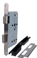
AS10449 60mm SS Radius Boxed