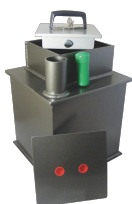
AS6011 25kg Key