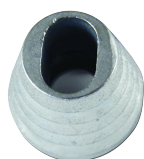
AS1996 35mm SC