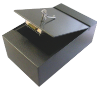
AS6002 10kg Key