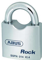
L19222 80mm - 83/80 Boxed