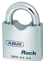
L19222 80mm - 83/80 Boxed