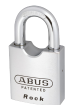
L19221 55mm - 83/55 Boxed