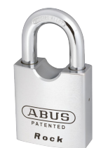
L19221 55mm - 83/55 Boxed