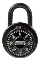
L19253 MK (KC507) Black 78KC/50