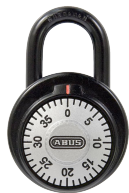
L19255 MK (KC510) Black 78KC/50